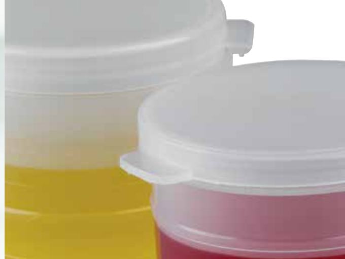
Thermo Scientific Capitol Vial Polypropylene Containers